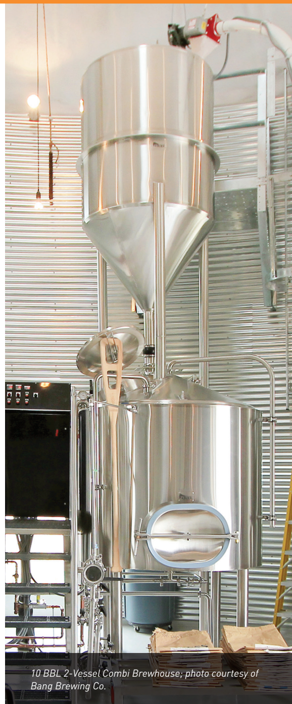
10 BBL 2-Vessel Combi Brewhouse