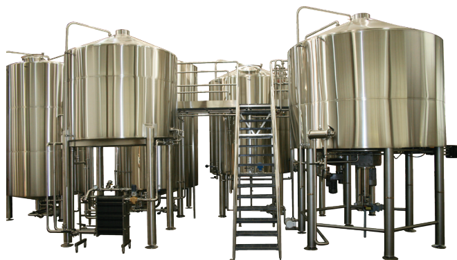
50 BBL 4-Vessel Brewhouse

A micro system is configured for a brewer who plans to focus on a set number of core beers to produce in large quantities for, primarily, off premise consumption. The microbrewery will keg, can, bottle, and distribute the beer. It is common for a microbrewery to have a tap room in which to serve their beer on premise.