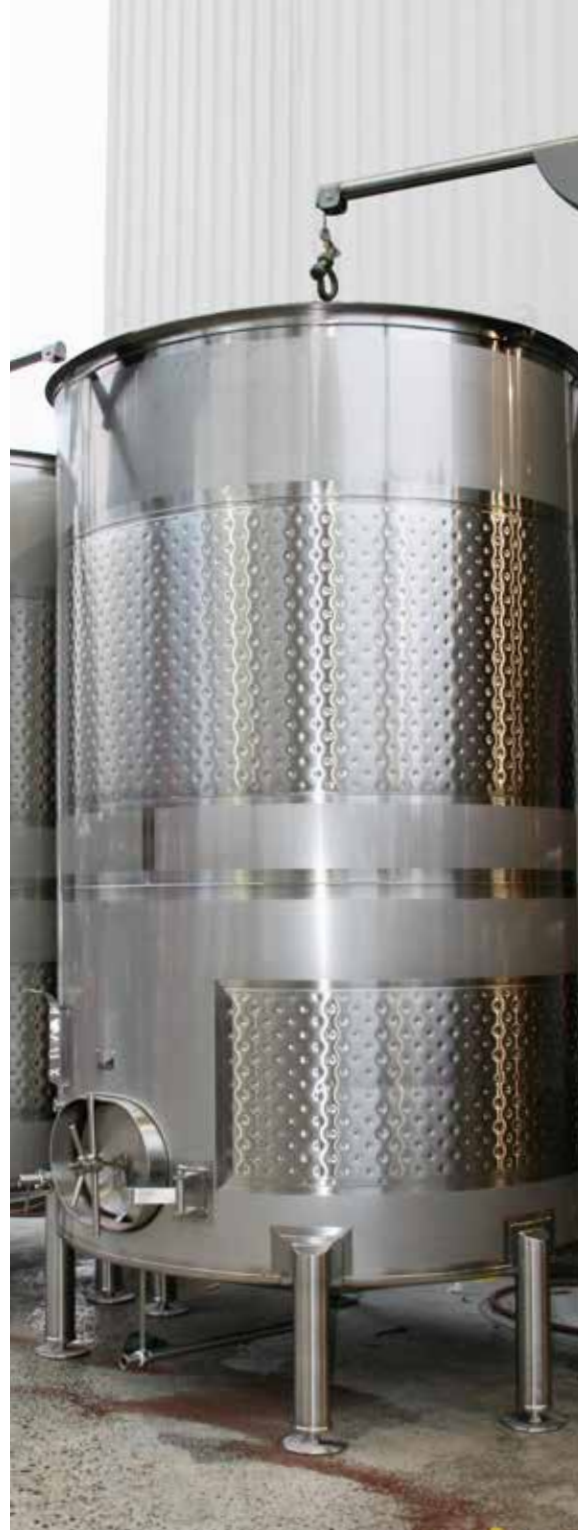
80 BBL Variable Capacity Open Top Cider Tanks Blue Mountain Cider Company