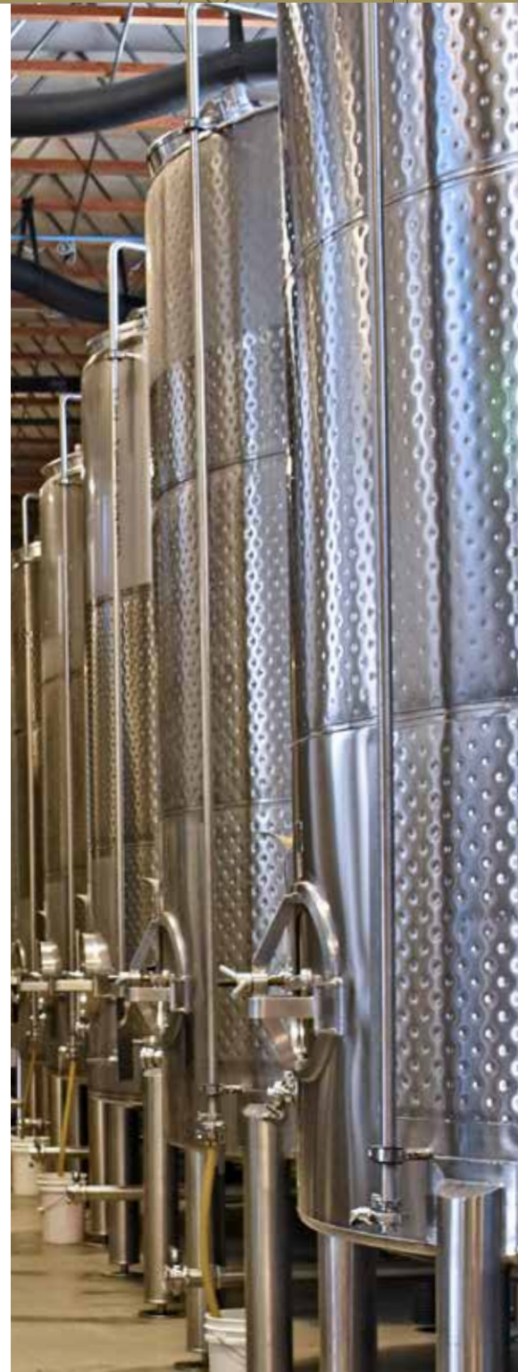
200 BBL Closed Top Cider Tanks; photo courtesy of 2 Towns Cider House