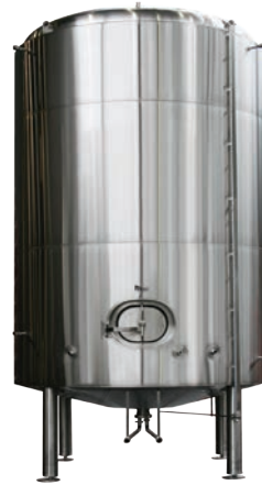
200 BBL BBT with Shadowless Inswing / Outswing Manway