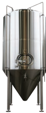
60 BBL Unitank with Shadowless Inswing / Outswing Manway