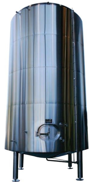
300 BBL BBT with Shadowless Inswing / Outswing Manway