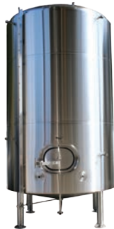
90 BBL BBT with Shadowless Inswing / Outswing Manway