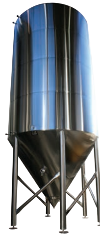
300 BBL Unitank with Bottom Cone Sideswing Manway