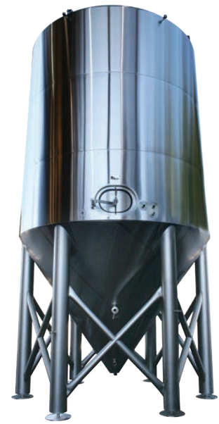
400 BBL Unitank with Shadowless Inswing / Outswing Manway